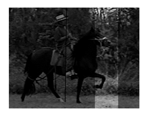
The horse on the left falls short of ideal.

Once we have established a group of horses that are strong, smooth, have advance, we would look at timing and overstep together. Horses with even four-beat timing, and overstep, can move to the head of the class. Horses that land with a heavier sound in front hooves than in the rear are put in lower categories. Then the final step is to put the horses in the order you have decided to place them, and then check thread. A good way is to ask the first place horse to go as slowly as possible in a good gait, and check how the other horses maintain their gaits and cadence. Then the lead horse would be asked to go a little faster, and a little faster, to